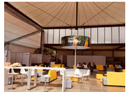
Plaza Quebec, where the Faith Pavilion is located