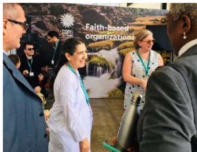
In the Faith Pavilion