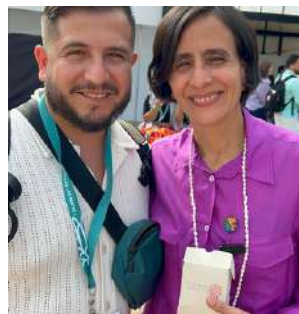
With Susana Muhamad, President of COP16 and Minister of Environment of Colombia