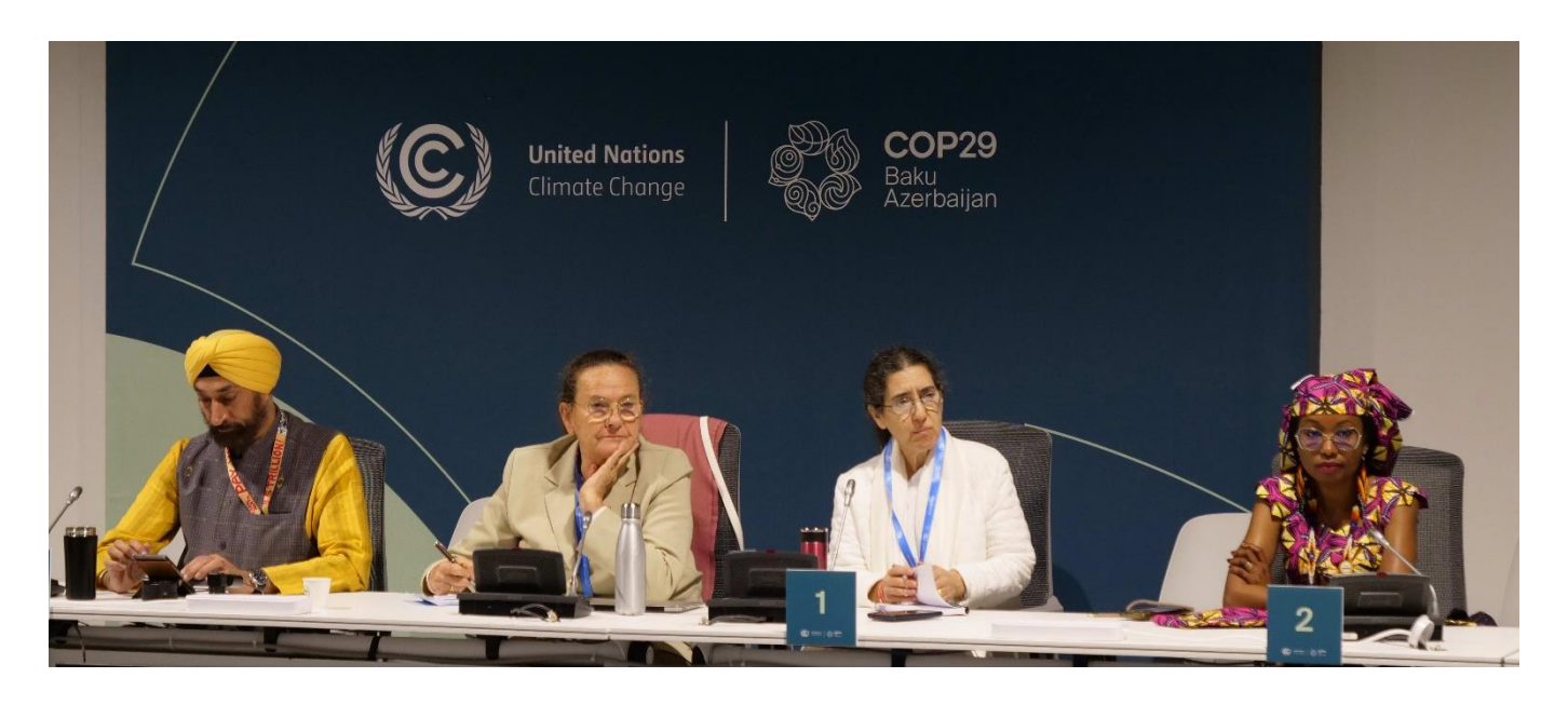
Interfaith Dialogue with UNFCCC