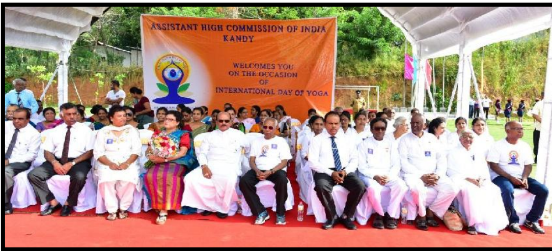
VIPs, IPs and members of the Raja Yoga Centre, Kandy & Matale