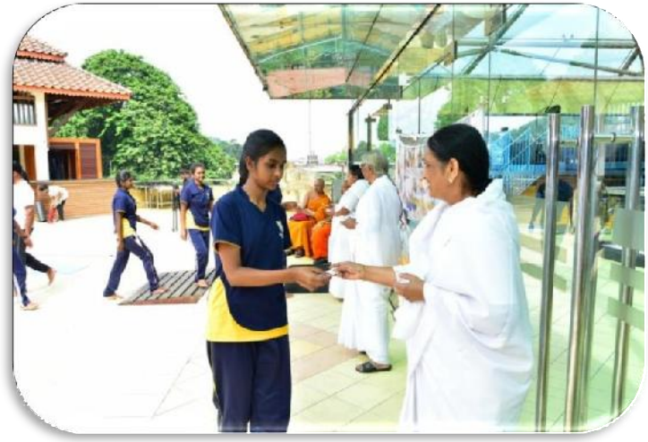
175 took part in this event and blessing card was distributed by 3 sisters to all