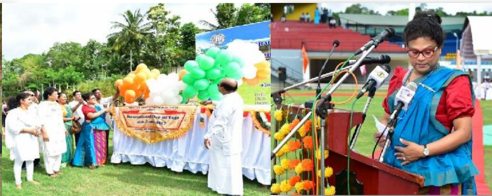
The 3 RD International Day of Yoga is launched by the Governor & Chief Minister