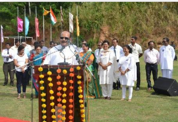
Address by the Chief Minister