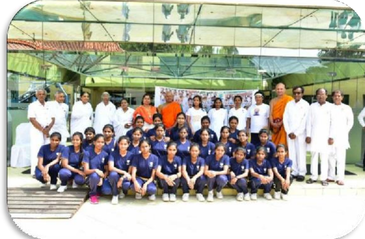
Both the priests invited the Brahma Kumaris to visit their respective temples to teach and conduct meditation on poya days for the benefit of pilgrims.