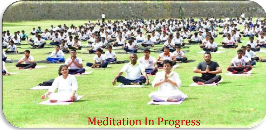
Meditation In Progress

The focus of the event was to bring awareness in the youth about healthy body and healthy mind.